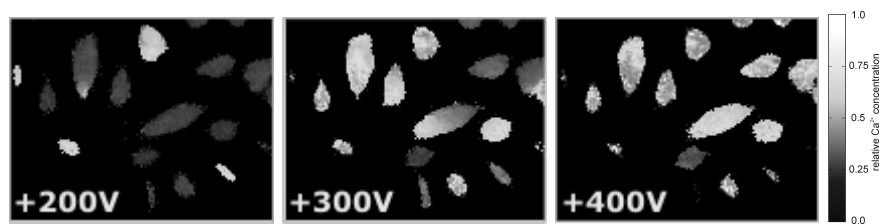
Figure 2: Cells stained with Fura-2AM and exposed to electric pulse with increasing amplitude.

Using a BetaTech device, deliver one electric pulse of 100 μs with voltages varying from 150 to 300 V. Immediately after the pulse, acquire two fluorescence images of cells at 540 nm, one after excitation with 340 nm and the other after excitation with 380 nm. Divide these two images in MetaFluor to obtain the ratio image ( R = F_{340}/F_{380} ). Wait for 5 minutes and apply pulse with a higher amplitude. After each pulse, determine which cells are being electroporated (Figure 2). Observe, which cells become electroporated at lower and which at higher pulse amplitudes.